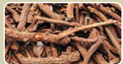
Manjistha Rubia cordifolia