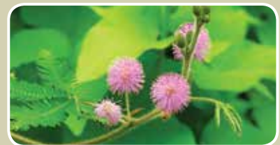
Lajvanti Mimosa pudica