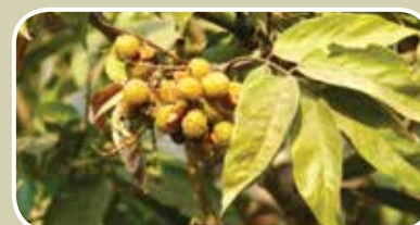
Reetha Sapindus trifoliatus