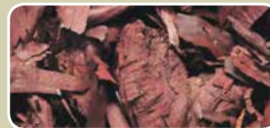
Ratanjyot Alkanna tinctoria