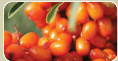
Badriphal Hippophae rhamnoides