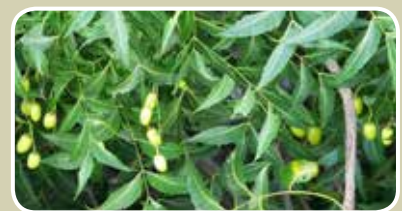
Neem Azadirachta indica