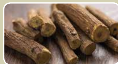
Mulethi Glycyrrhiza glabra