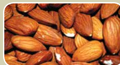
Badam Prunus amygdalus