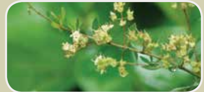
Henna Lawsonia alba