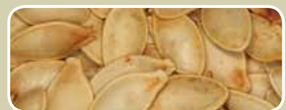
Kushmanda Cucurbita pepo