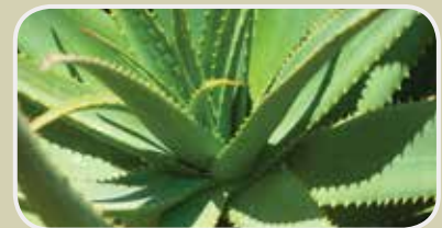
Ghrit kumari Aloe vera