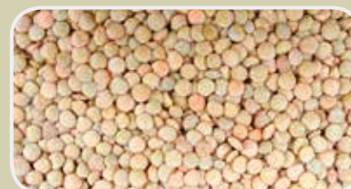
Masoor Lens culinaris