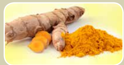
Haldi Curcuma longa