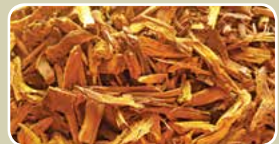
Daru Haldi Berberis aristata