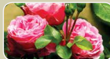
Gulab Rosa centifolia