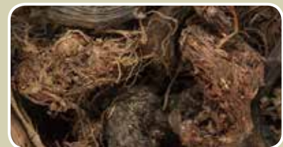
Jatamansi Nardostachys jatamansi