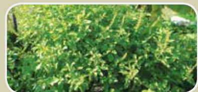
Tulsi Ocimum sanctum