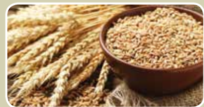
Wheat Kernel Triticum sativum