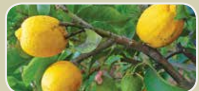
Lemon Citrus medica