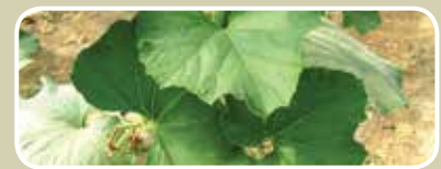
Bottle gourd Lagenaria siceraria