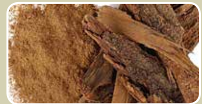
Babool Acacia arabica