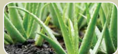
Ghrith kumari Aloe vera