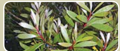
Tea Tree Melaleuca leucadendron