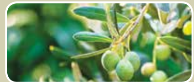
Olive Olea europea