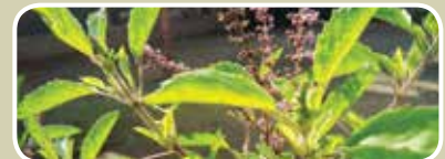
Tulsi Ocimum sanctum