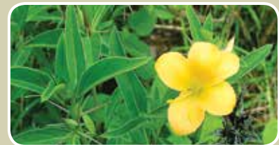
Vajradanti Barleria prionitis