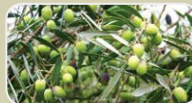
Olive Oil Olea europaea